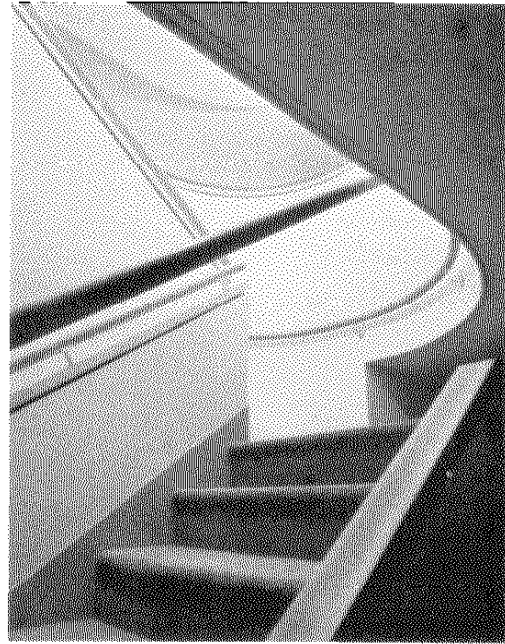
Martin Holub Architects, World-Wide Business Centers, New York City.

An example of this design-from-within approach is his Nashville TN Rokeby Condominium, which elegantly resolves a common but seldom visually expressed developer's quandary: how does one plan for the vagaries of market demand? His response was to design a flexible floor plan which permitted a wide range of apartment sizes to interlock differently on every floor. This allowed the condominium market itself to determine final apartment distribution: buyers were ordering apartments of their choice while the building went up, selecting from a stock of 23 apartment sizes rather than the usual two or three. Seemingly random exterior window patterns express the apartment layouts that were chosen on each floor. The building's final appearance has thus been determined by this unique solution to the client's problem, exemplifying the view of design as an honest response to the specific conditions of each project.